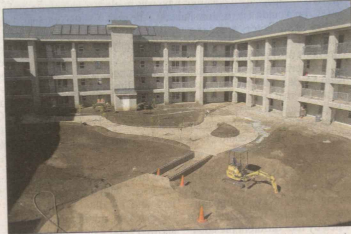
The courtyard and the rest of the student housing facility is visible from an upstairs, open-air study area.

Registration for apartments is ongoing, and units are available on a first-come, first-served basis. Four single wheelchair-accessible units are being constructed to accommodate students with special needs. When finished, the complex